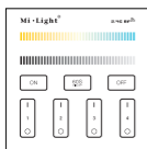
B2 / T2