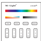
B4 / T4